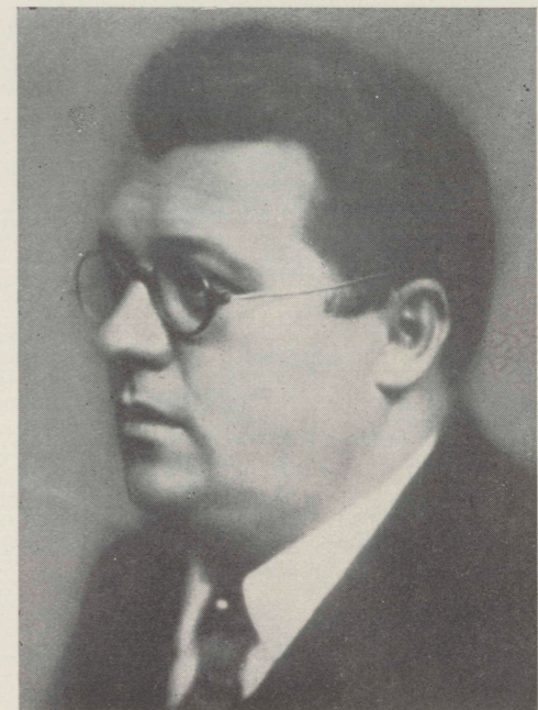
Landeshauptmann von Salzburg