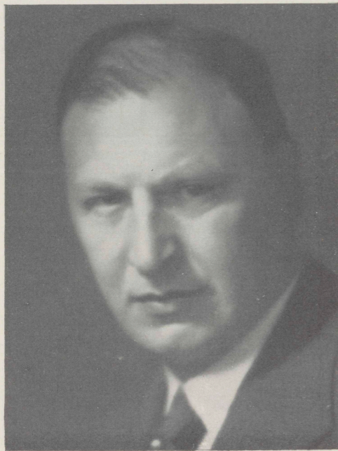
Landeshauptmann von Steiermark