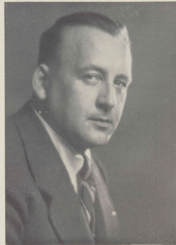
Staatssekretär (Generalsekretär der D. F.) Guido Zernatto