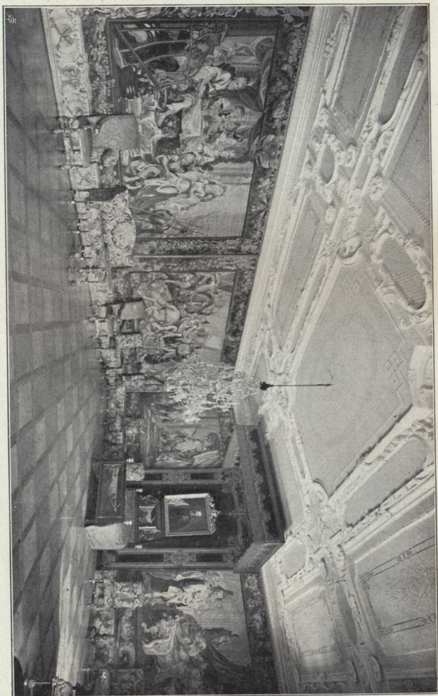
Kaiserszimmer oder Gobelinzimmer.