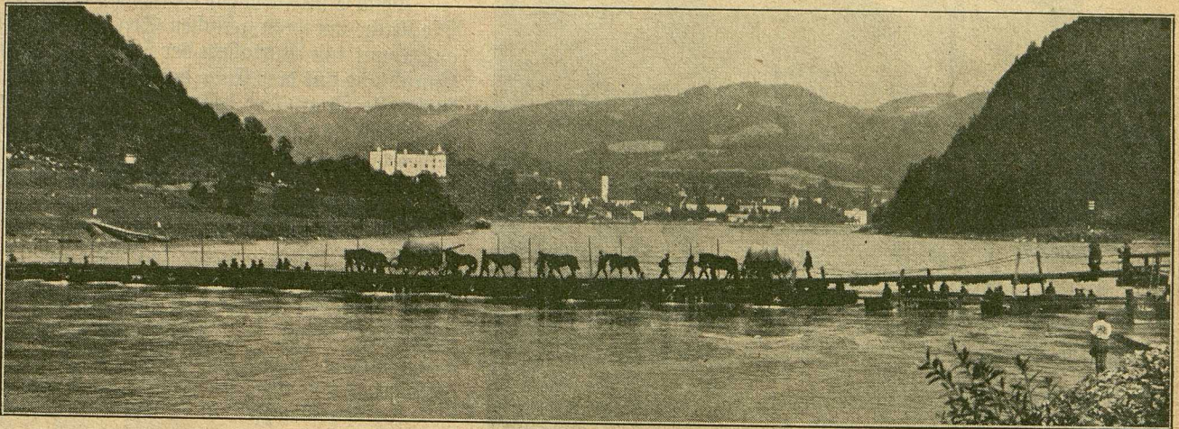
Eine Trainsolonnen fährt über die Kriegsbrücke Bild nebenstehend