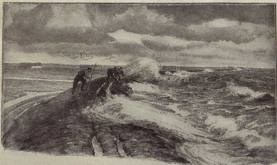
Winter-Sturmflut an der französischen Küste.