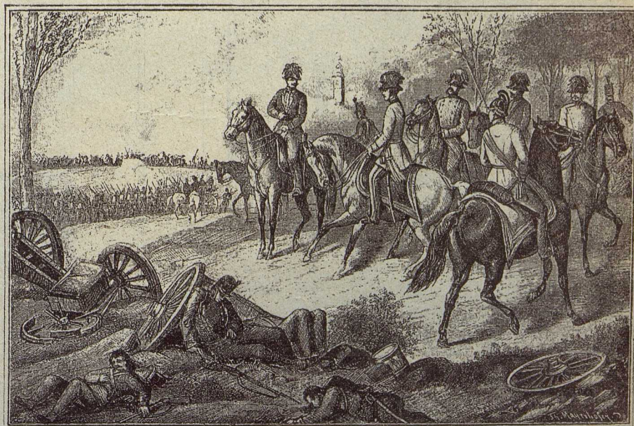
Eine Kriegs-Jugenderinnerung des Kaisers: Erzherzog Franz Josef am Schlachtfeld von Santa Lucia.