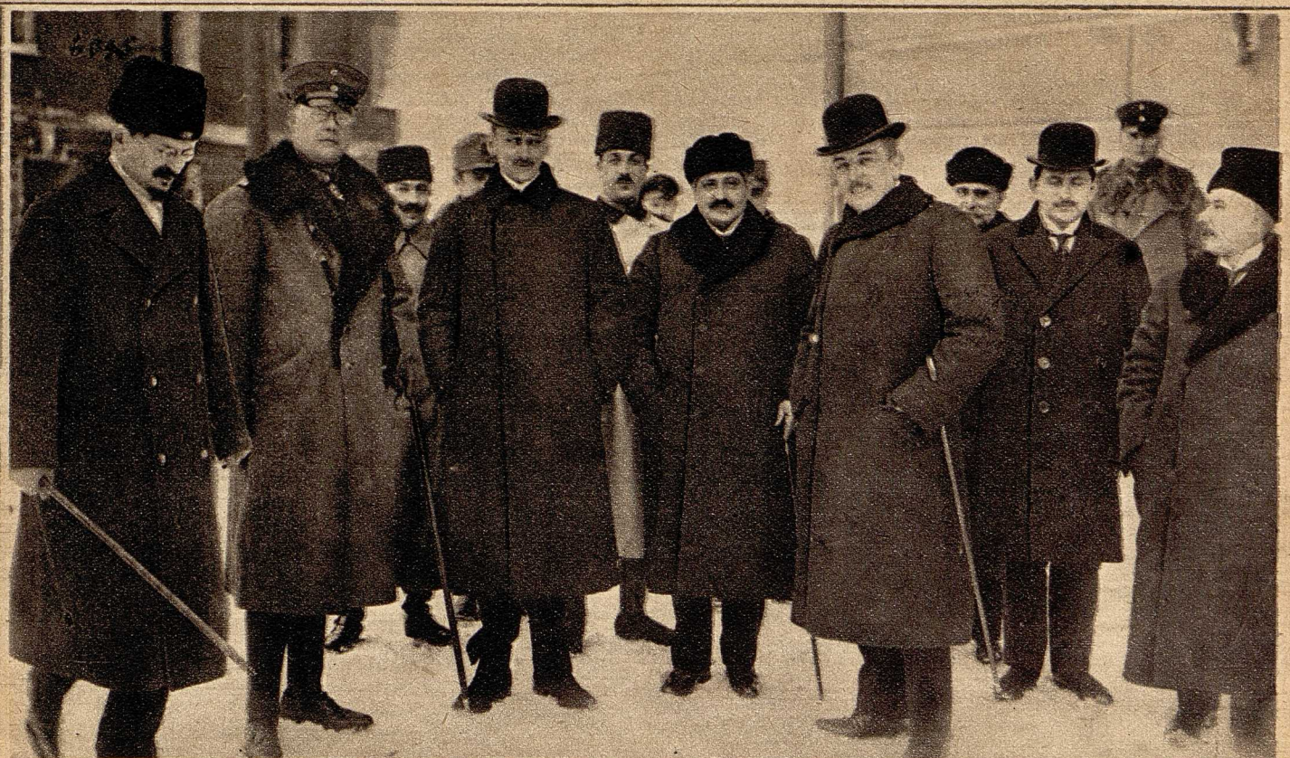
Die Wortführer in Brest-Litowsk: Trogki, General Hoffmann, Czernin, Zataat Pascha, Köhlmann.