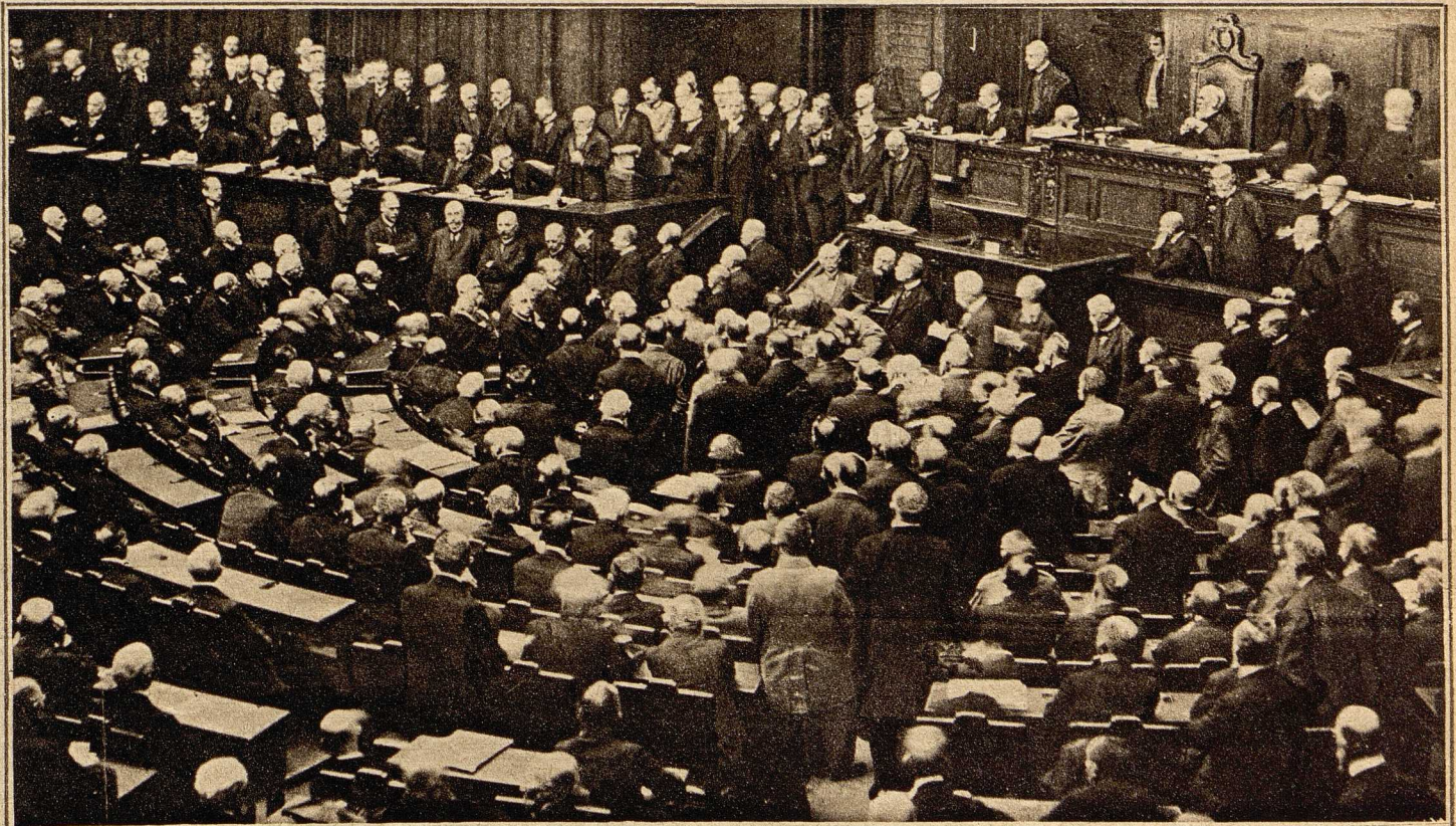
Die Eröffnung der Wahlrechtsdebatte im preussischen Abgeordnetenhaus. Die Rede des Grafen Hertling (X).