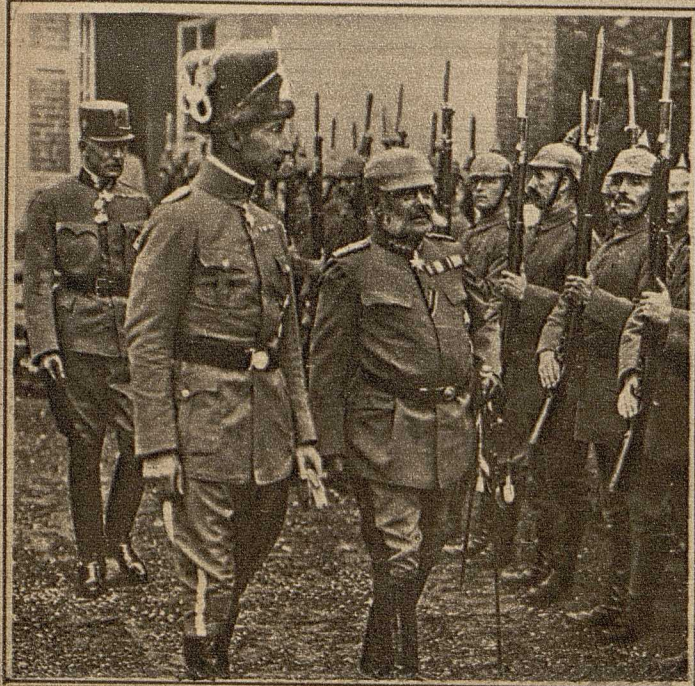
Feldmarschall Erzherzog Friedrich von Oesterreich zum Besuch an der Westfront beim deutschen Kronprinzen.