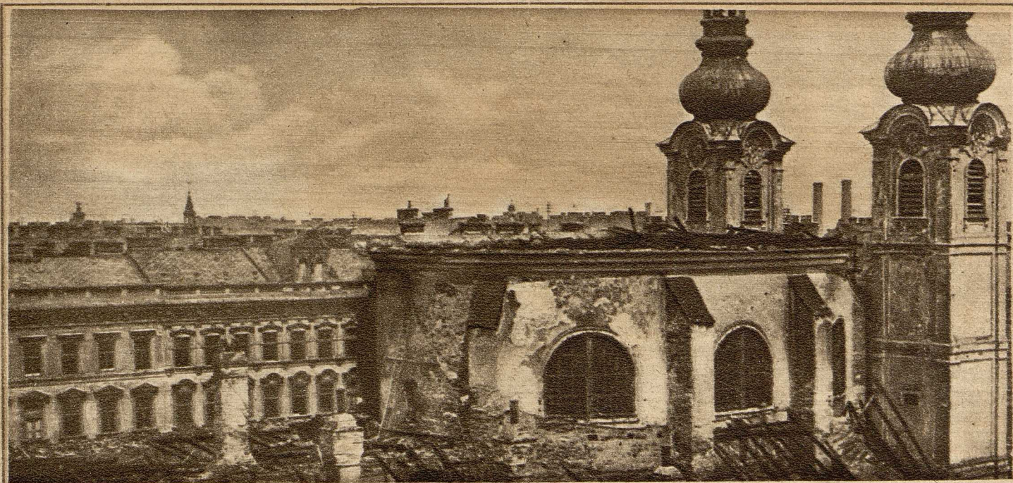
Großbrand der Servitenkirche in Wien. Die an Kunstwerken und berühmten Gemälden reiche altberühmte Kirche fiel einer verheerenden Feuersbrunst zum Opfer.