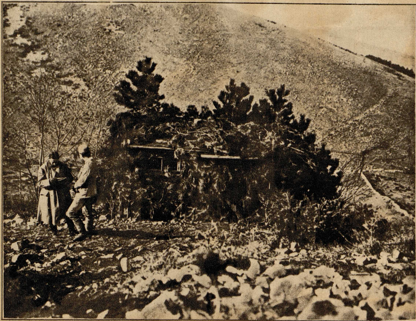
Der Fajthi Grib, um dessen Besitz während der 10. Monzschlacht erbitterte Kämpfe stattfanden.