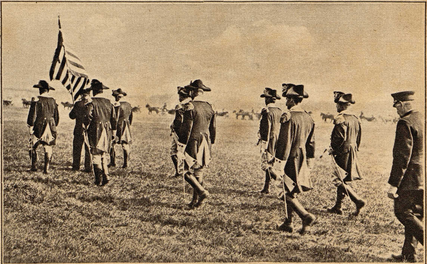
Amerikanische Milizoffiziere in ihrer bisherigen Parade-Uniform. (Hünich)