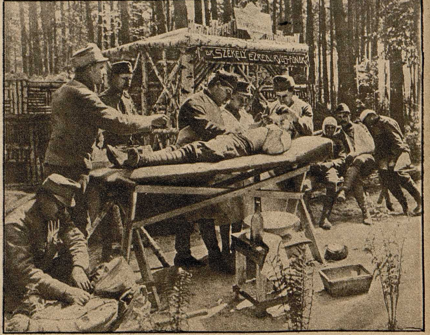
Aus den Kämpfen in Wolhynien. Chirurgisches Ambulatorium bei den k. u. k. Truppen im Wolhynischen Urwald.