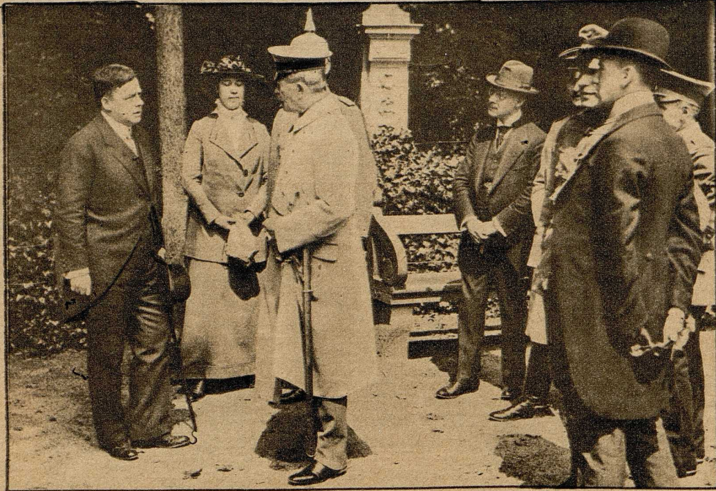
Empfang neutraler Journalisten beim Generalgouverneur von Belgien, Febr. v. Biffing, in Brüssel.