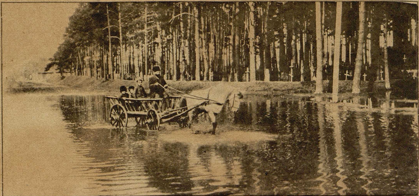
Unten: Das vielumsfrittene Baranowitschl. Ueberschwemmte Straße; im Walde zahlreiche Kriegergräber.