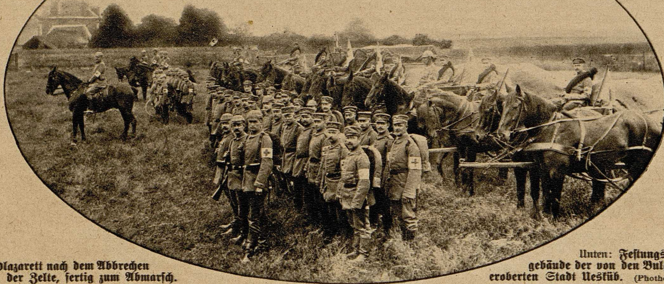
Feldlazarett nach dem Abbrechen der Zelte, fertig zum Abmarsch.