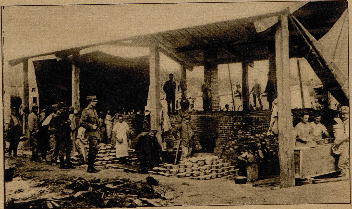
Unten: Italienische Feldbäckerei hinter der Front.