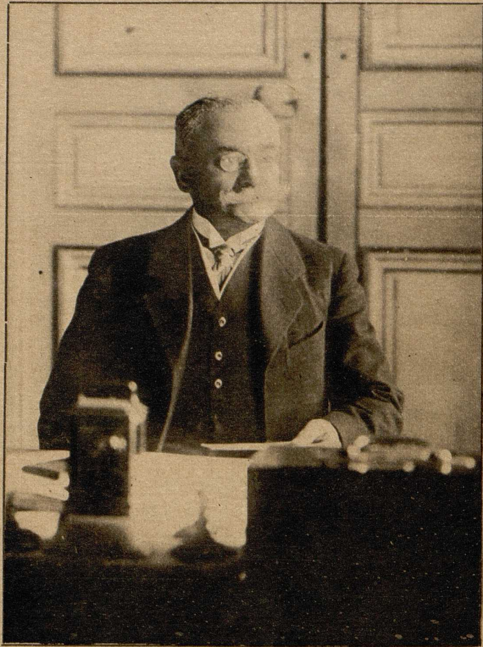
Der französische Minister des Aeußeren Delcassé, trat von seinem Posten zurück.