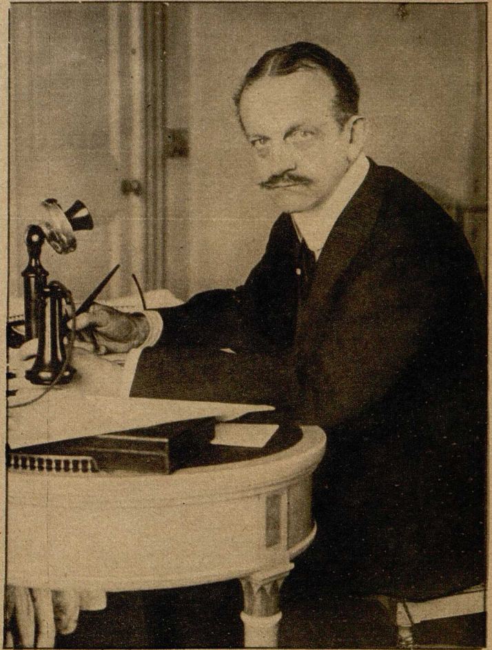
Graf von Bernstorff, der deutsche Botschafter in den Vereinigten Staaten.