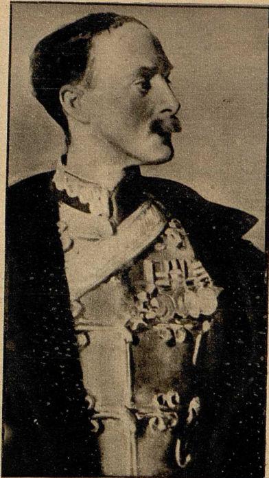
Der englische General Hamilton.