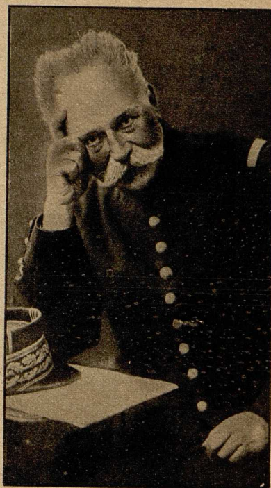
Der französische General Sarrail.

Zur englisch-französischen Truppen- landung in Saloniki.