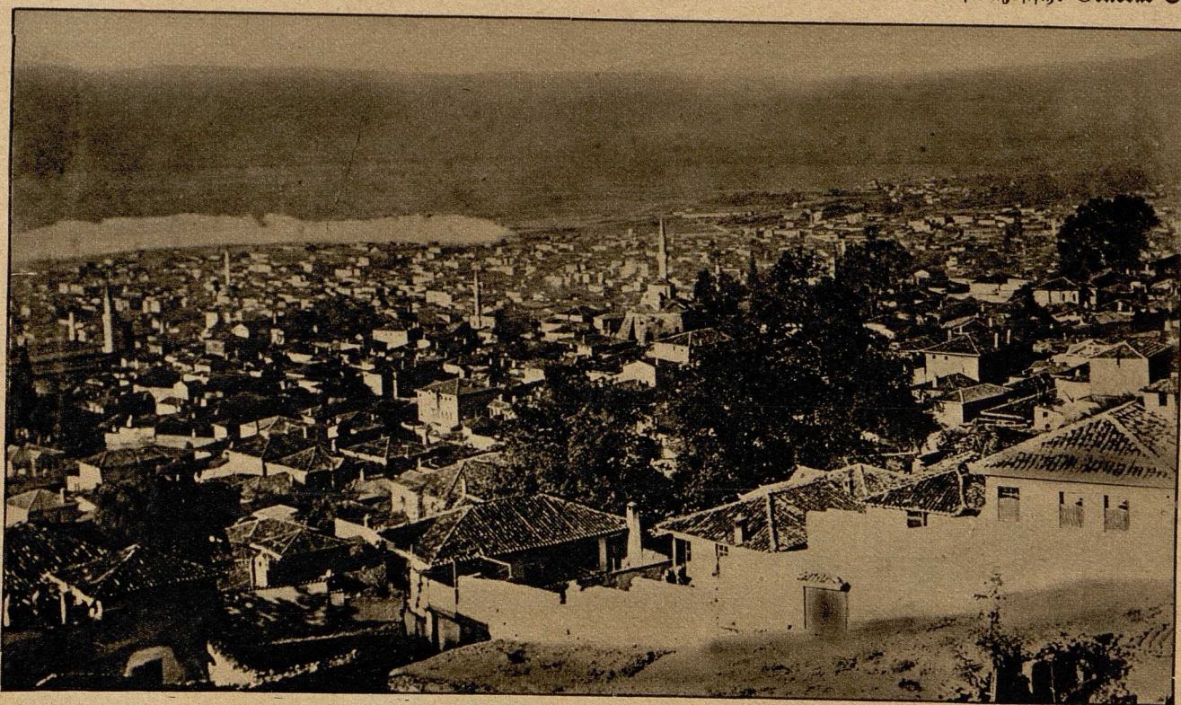
Der Hafen von Saloniki.