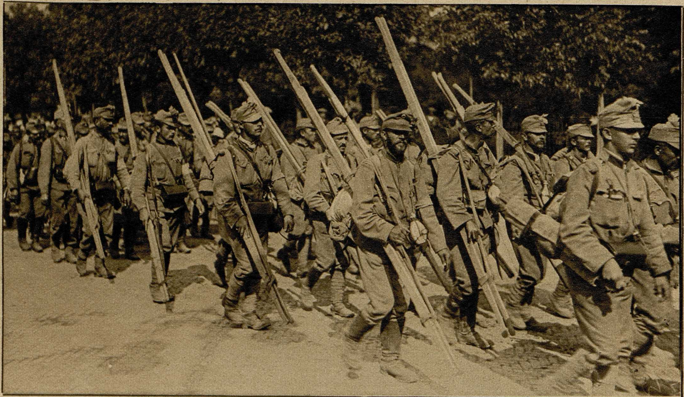
Oesterreichisch-ungarische Infanterie mit zusammenlegbaren Tragbahnen.