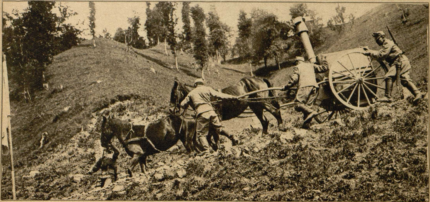
Fahrbarer Backofen der österreichisch-ungarischen Armee in gebirgigem Terrain auf dem östlichen Kriegsschauplatz. Der Ofen bäckt in 12 Stunden 6-700 Brote.