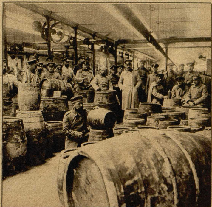
Wie ein mobiles Armeekorps versorgt wird. Links: Der dauernd gefüllte „Korpsstall“, dem das Proviantamt täglich Schlachttiere entnimmt. Rechts: Blick in die Küferei eines Armeeproviantamts.