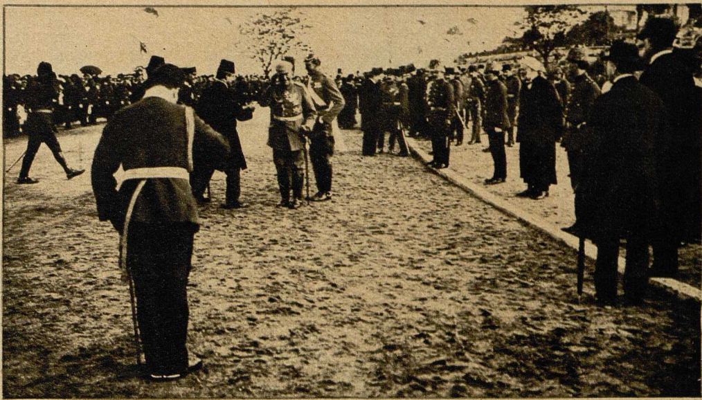
Kapitänleutnant Müde (1) nach dem Empfang durch den türkischen Kriegsminister Enver Pascha (2).