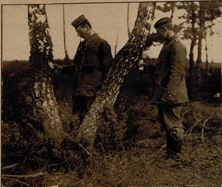
Frühlingskur bei unseren Feldgrauen. Aufpassen des Benzsafftes von Birken.