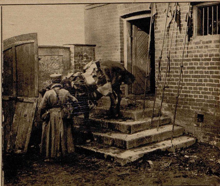
Ein ungewohn- ter Anblick: Hufar führt sein Pferd die Treppen hin- unter aus dem Quartier.