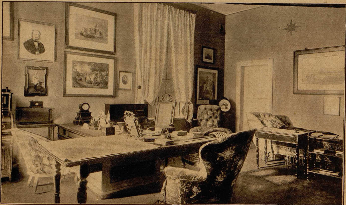
Interessantes Bild: Bismarcks Arbeitszimmer im Schlosse zu Friedrichruh. (Vor dem Ruhesofa neben der Tür steht das Tischchen, an dem der Präliminarfrieden von Versailles unterzeichnet wurde.)