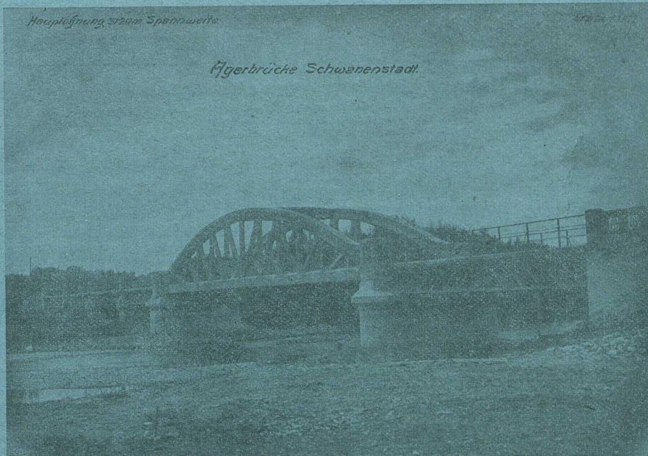
Hauptöffnung 52,000 Spannweite

Zentrale: Gesellschaft m. b. H. Zweighbureau: WIEN, IV., Möllwaldstrasse Nr. 4 LINZ a. D., Bürgerstrasse Nr. 16