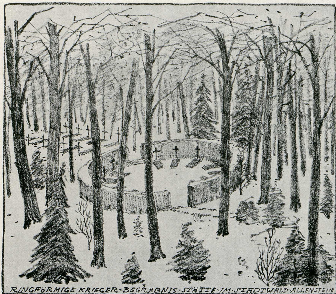
RINGFÖRMIGE KRIEGER-BEGRÄBNIS-STÄTTE IM STADTWALD ALLENSTEIN

Aus den Vorschlägen der in die östlichen Kampfgebiete entsen- deten Künstlergruppen.