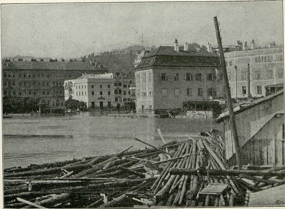
Hochwasser 1899: Treibholz an der Schiffslände, 15. September.