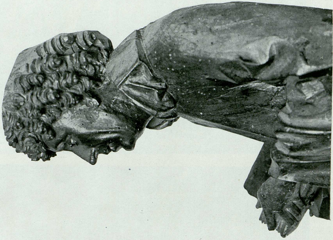
b) Stephanus (Detail).