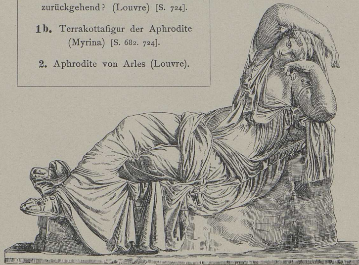
6. Schlummernde Ariadne (Vatikan) [S. 731].

3a. Aphrodite von Capua, mit Schild zu ergänzen (Neapel).