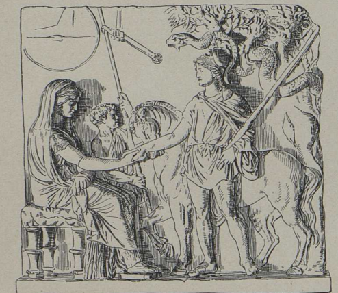
3. Grabrelief (Lateran) [S. 671].

2 e. Torso der Dionysosstatue vom Monument des Thrasyllus in Athen (Brit. Mus.) [S. 670].