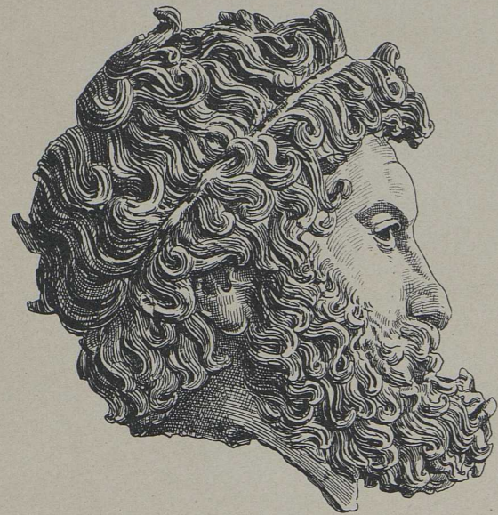
1 a. Bronzekopf eines Faustkämpfers (Olympia).