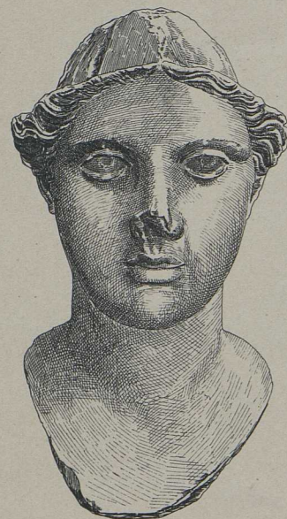
2 a. Kopf der Athena von Eubulides, mit abgebrochenem Helm (Athen) [S. 673].