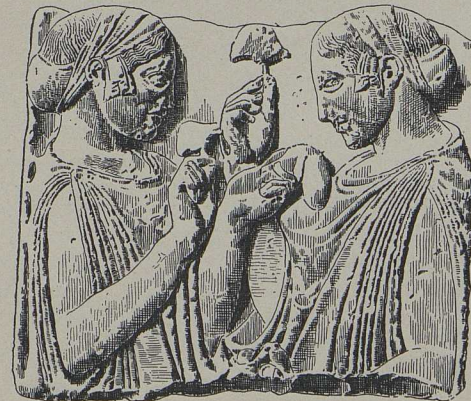
8. Grabrelief zweier Frauen aus Pharsalos (Louvre) [S. 613].