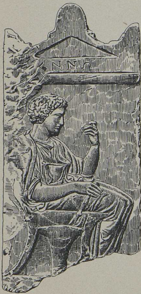
3. Grabstele der Myrno (Athen) [S. 613].