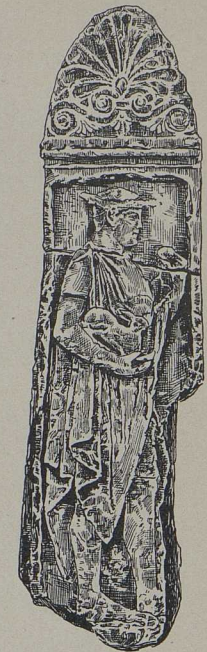
7c. Grabstele eines jungen Mannes mit einem Hasen und einem Apfel, aus Larissa (Athen) [S. 613].