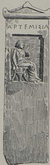
4b. Grabstele der Artemisia (Athen) [S. 613].