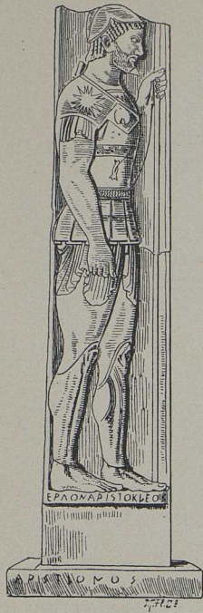
1. Grabstele eines athenischen Ritters mit Namen Aristion, von Aristokles (Athen) [S. 612f.].