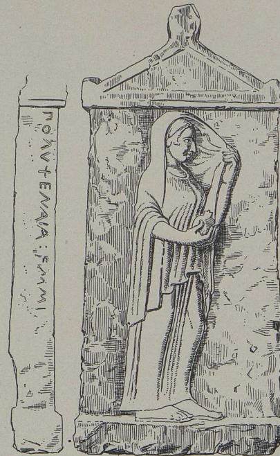
7a. Grabstele der Polyxenaia aus Larissa (Athen) [S. 613].