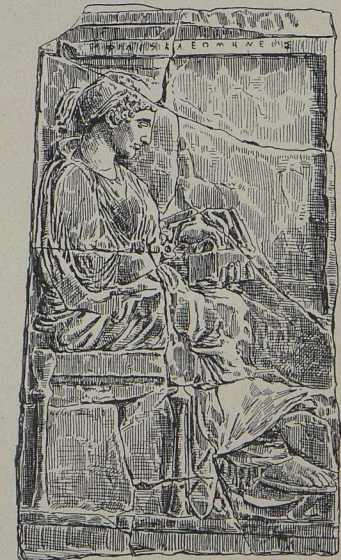
9. Grabstein einer Frau mit Namen Philis aus Thasos (Louvre) [S. 613].