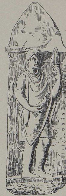
7b. Grabstele des Vekedamos aus Larissa (Athen) [S. 613].