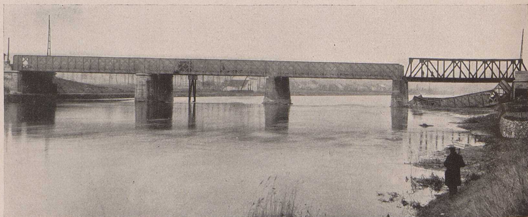
Bild 9. Die Maas-Brücke bei Anhée nach ihrer Wiederherstellung. (Zu Seite 70.)