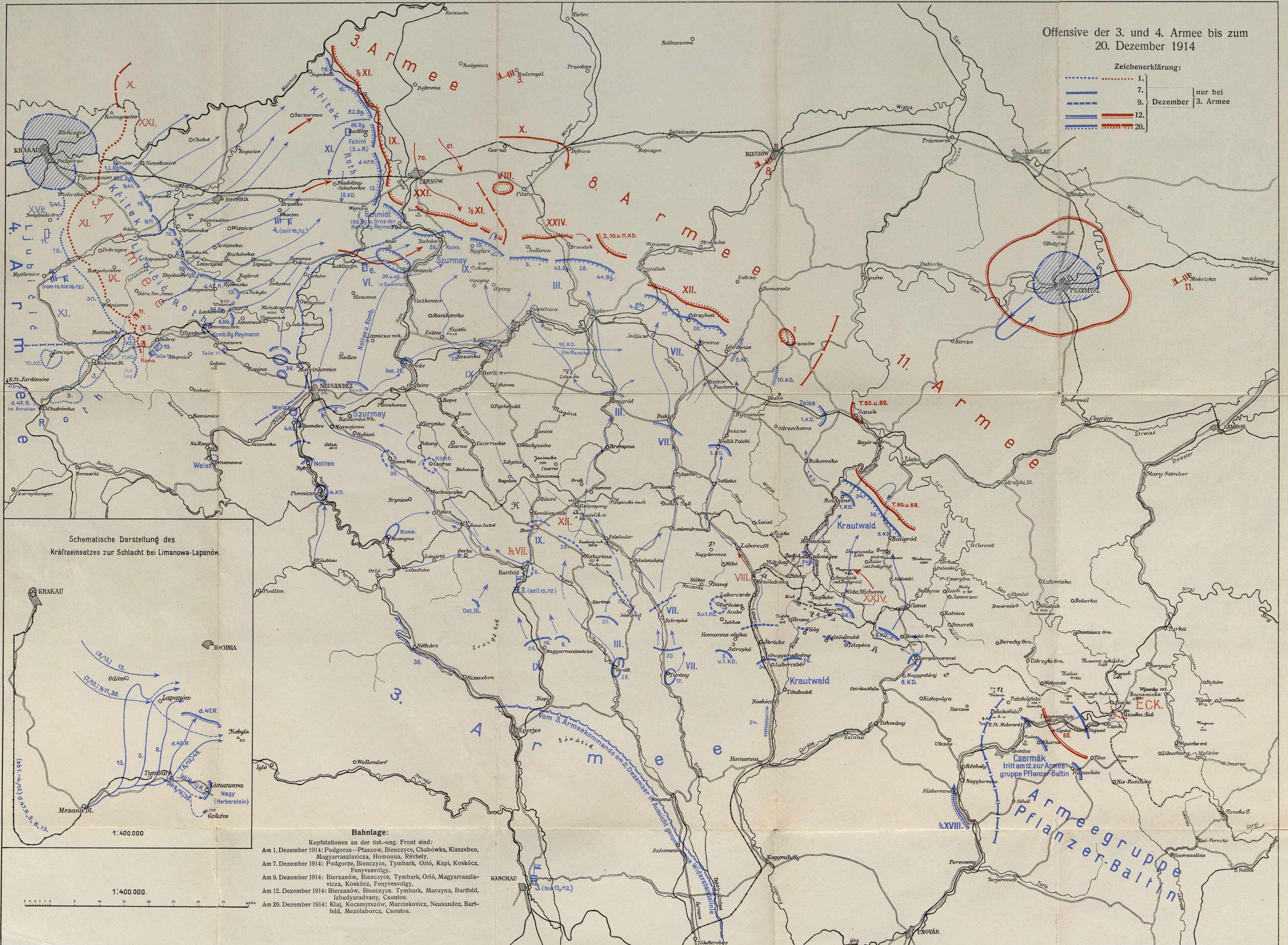
Schematische Darstellung des Kräfteinsatzes zur Schlacht bei Limanowa-Lapanów.