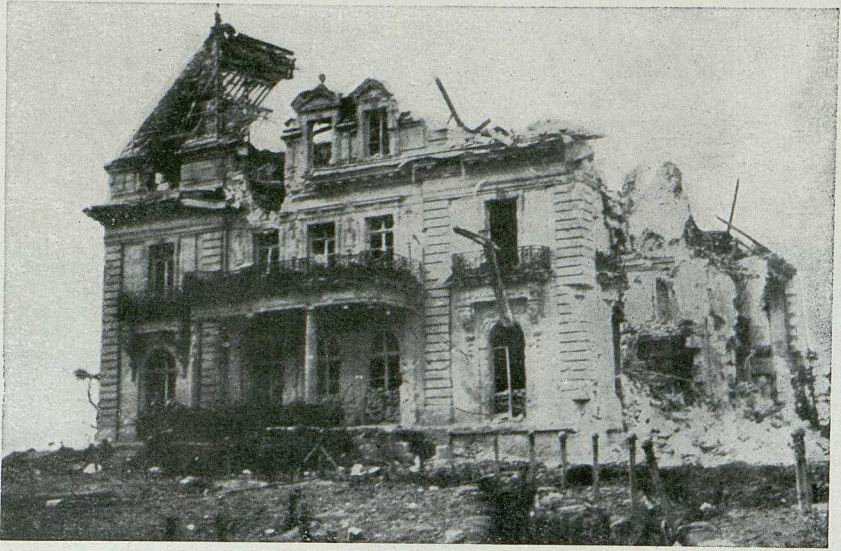
Schloß Hollebeke 1915.