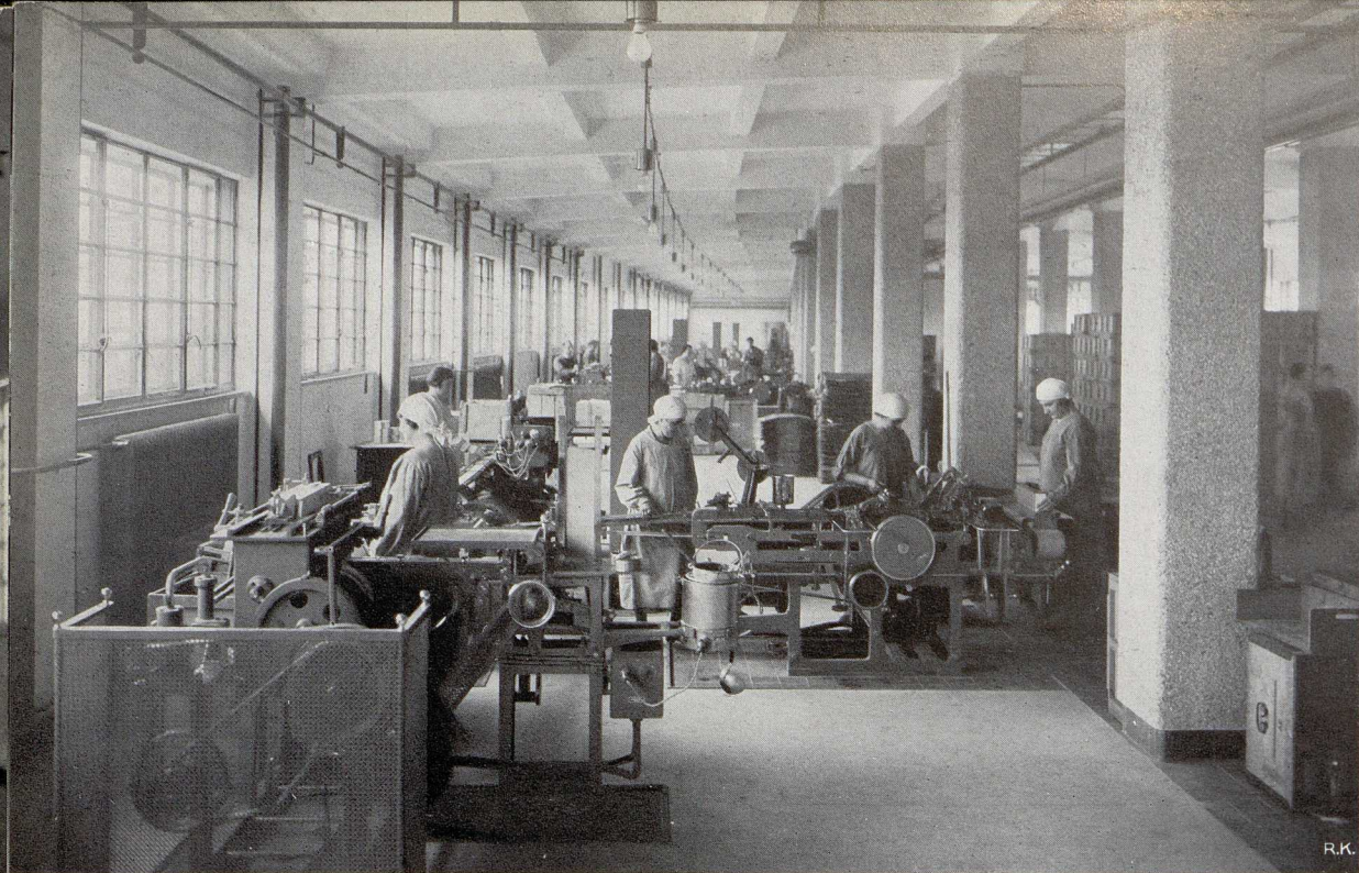
Abb. 107. Lerner-Fließanlage zur Erzeugung von Kappenschachteln