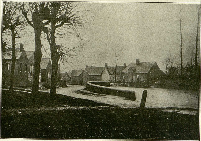
Der von den Franzosen gegen 4/79 verteidigte Dorfsteich in Audigny.