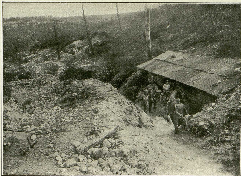
Unterstände in den Argonnen.