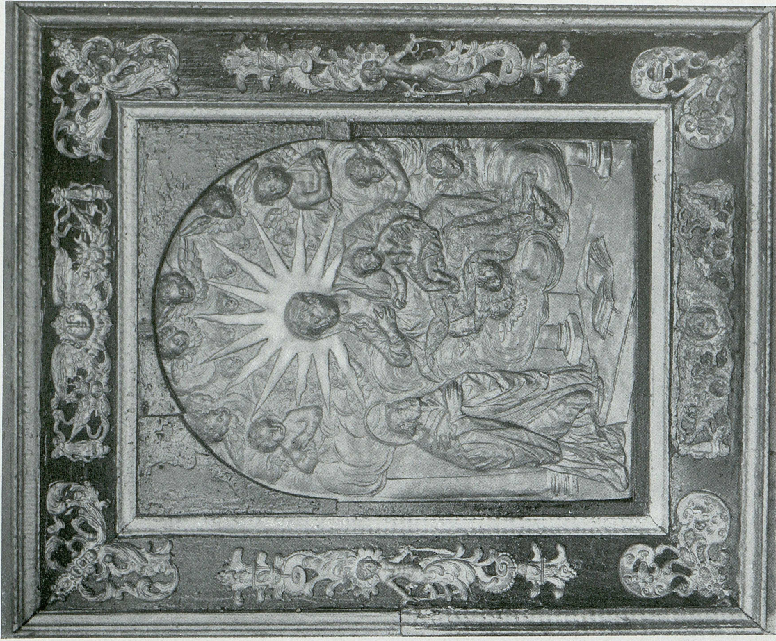
Abb. 117. Mariabründl, Metallrelief, hl. Bernhard von Clairvaux (S. 97).